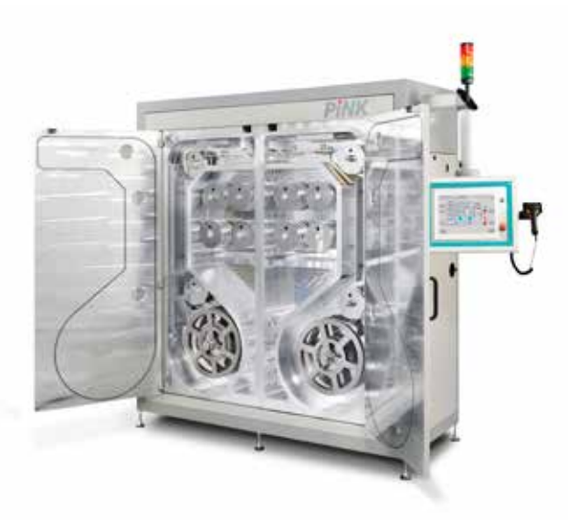
Example for a reel-to-reel system by PINK.

PINK designs customized systems for this application. For example a system consisting of three chambers: One for unwinding, winding and intermediate plasma treatment, respectively. An interleave can be removed and supplied automatically.