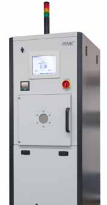
The V55-GKM unit is designed for the plasma activation of medical engineering products.

The plasma treatment of the modules occurs in short treatment cycles of about four minutes. Several hundred pieces can be activated simultaneously, depending on the system size. Therefore the modules are lined up in a bunk shelf, which can even be rotated to achieve a better homogeneity by the treatment. For the treatment of a higher number of items the process can fully be automated.