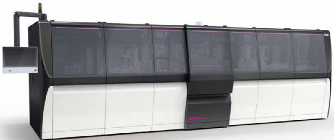
Automated Inline system SIN 200+ modular with preheating, sintering and cooling module. Fully automated handling system for loading and unloading on PiNK carriers as well as with transfer system with underfloor return and lifting units.